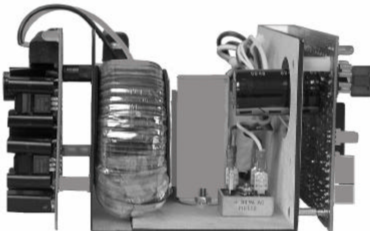
PSAMP-101 AMP-25-50 & PS-AUX ASSEMBLY Part # 910565 Size: 6.75" W x 8" H x 4.25 D

Provides power for Auxiliary Amp-25-50. Provides power for Strobe Supervisory Modules. Provides Power for auxiliary relays and other modules