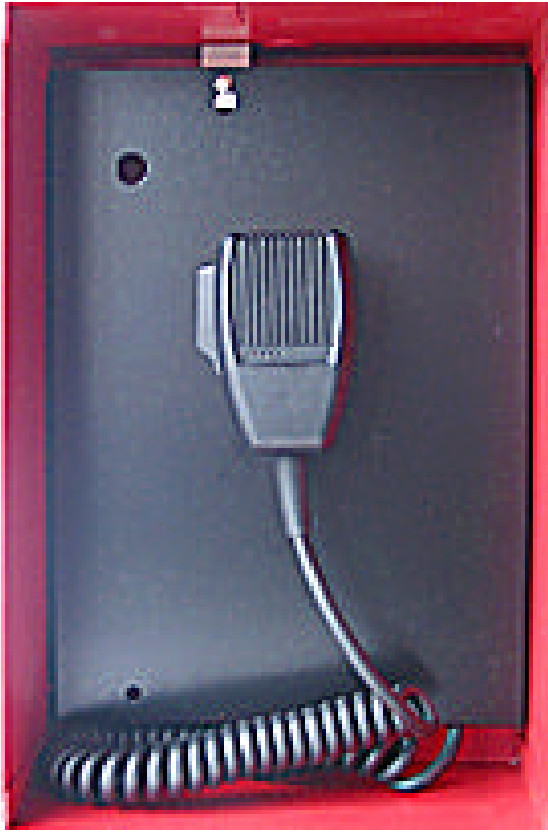
RMT-PG-A shown without lid Part # 910591 Size: 12.25" x 8.25" x 4.5"